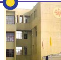
The Shri Ram Schools Established in 1988

Shri Educare Limited (SEL- Established in 2008) aims to combine the pedagogical strengths of The Shri Ram Schools and the internal IT strength to support and develop quality educational establishments in the K - 12 sector across India and abroad.