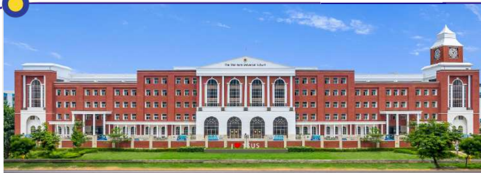
The Shri Ram Universal School (TSUS) Greater Noida (West)

The Shri Ram Schools, established in 1988, are a manifestation of the vision of Smt. Manju Bharat Ram who felt a strong need to build an alternative model of school education in Delhi.