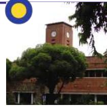
Shri Ram College of Commerce (SRCC)

Carrying the legacy of its Group Founder, Sir Shri Ram who was instrumental in setting up premium educational institutions such as the Shri Ram College of Commerce (SRCC) and Lady Shri Ram College for Women (LSR) .