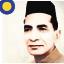
Sir Shri Ram (Apr. 27, 1884 - Jan. 11, 1963) Founder, The Shri Ram Group

Carrying the legacy of its Group Founder, Sir Shri Ram who was instrumental in setting up premium educational institutions such as the Shri Ram College of Commerce (SRCC) and Lady Shri Ram College for Women (LSR) .