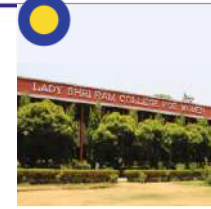
Lady Shri Ram College for Women (LSR)

Shri Ram College of Commerce (SRCC- Established in 1926) is ranked 1st amongst Commerce Colleges in India for more than 12 years.